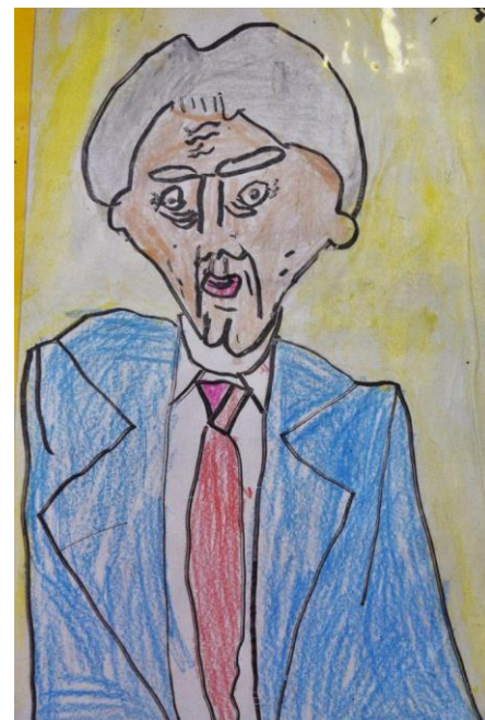
Stem Bridges V5