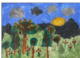
Paradise apocalypse Maya Patel