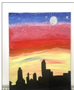
Skyline Sensation Layla Oyekan