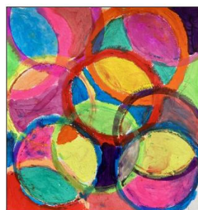
The mystery of circles Deven Shah