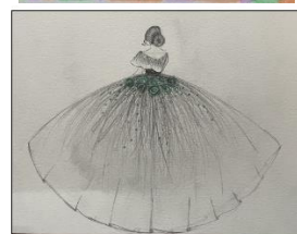
Ball gown Poppy Scales