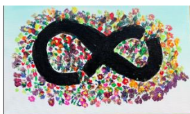
Forever flowers! Idil Ozyigit