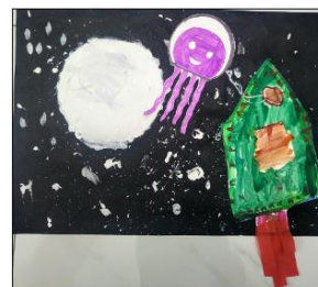
Trip to Space Vihaan Gupta