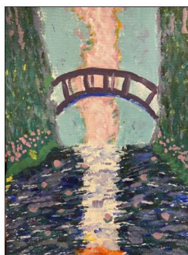
The Bridge to the Unknown Amelie Armitage