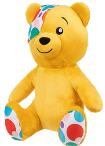
Guess the name giant Pudsey £1.00 per entry.