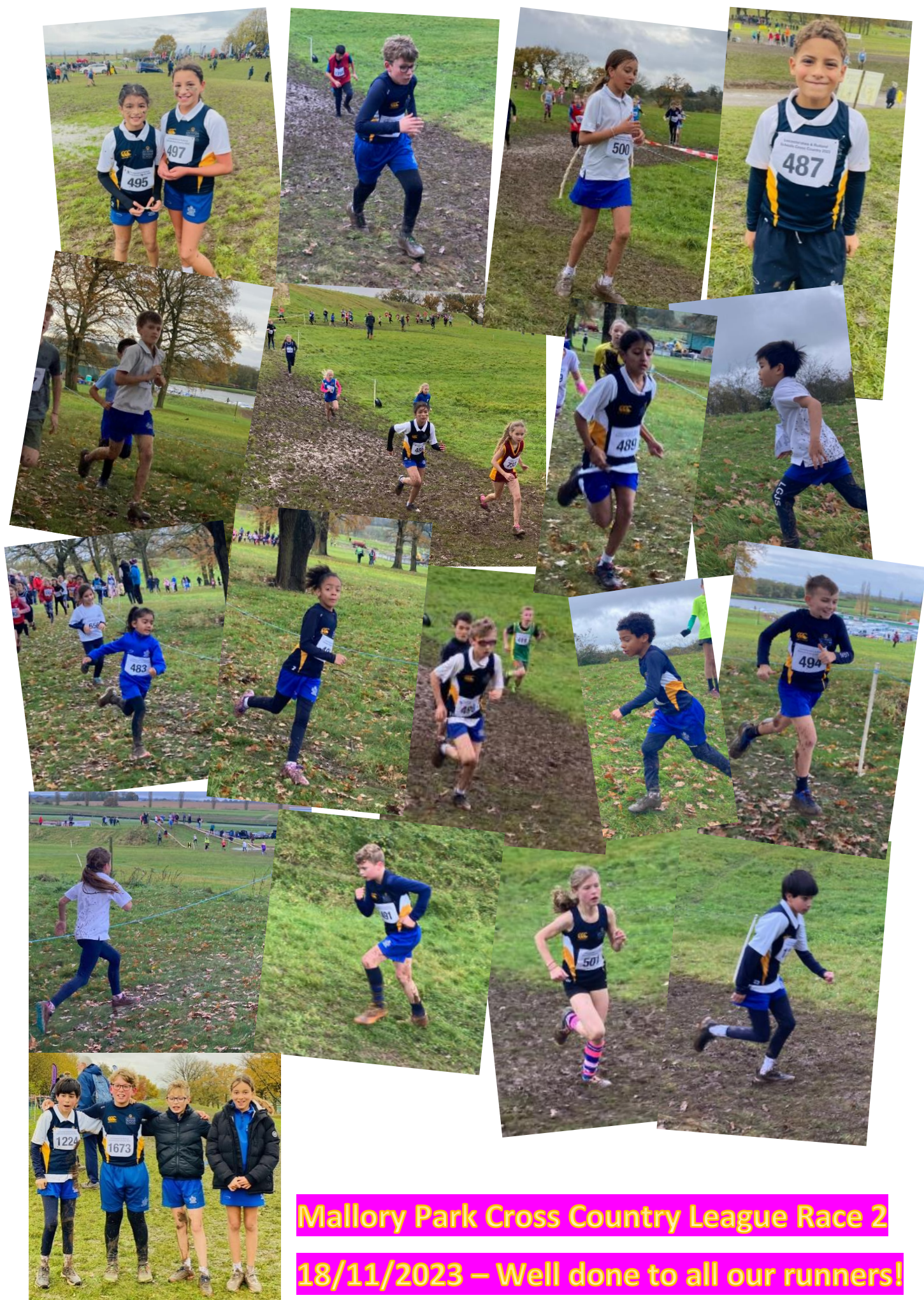
Mallory Park Cross Country League Race 2 18/11/2023 – Well done to all our runners!