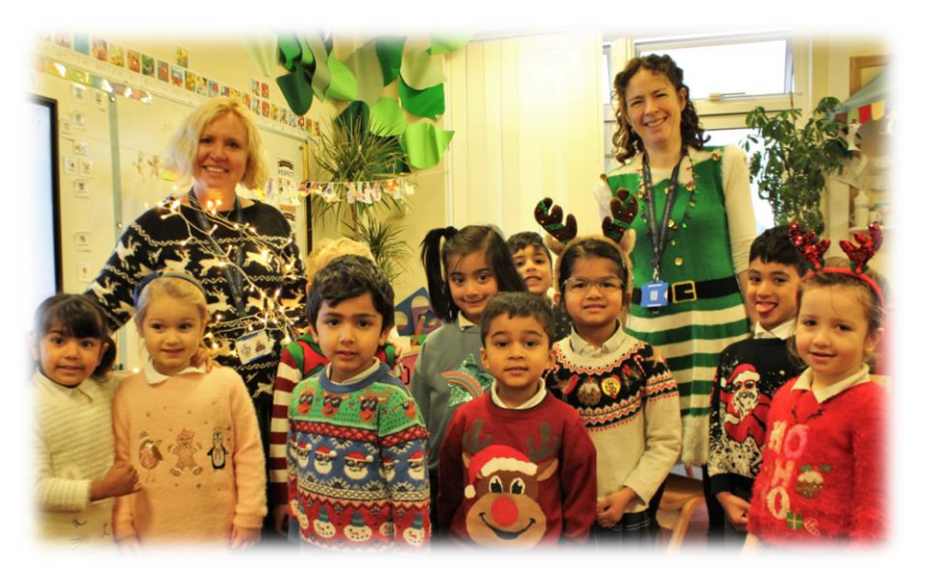
Christmas Jumper Day on Thursday brought smiles to everyone's faces