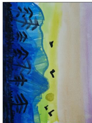
Sunset Aarush Gupta