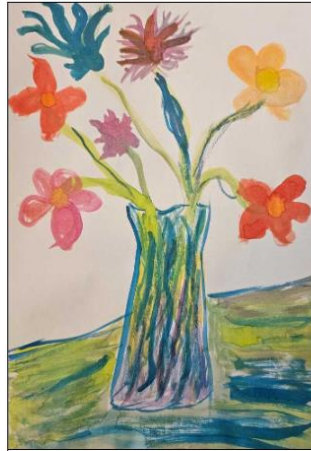
Spring Blossom Riya Chandarana