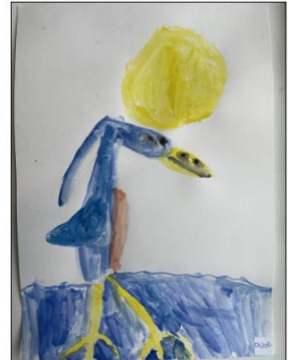
Kingfisher Chloe Colombo