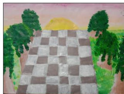
A sunset imagined Eki Iyasere